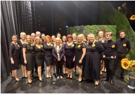
The Mayor and Consort attended the incredible performance by CAODS (Chelmsford Amateur Operatic And Dramatic Society) of Calendar Girls at the Chelmsford Theatre.