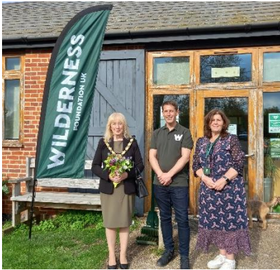
Turnaround Graduation at the Wilderness Foundation UK was an incredible afternoon, witnessing the amazing work taking place, enabling the young people to get their lives back on track.