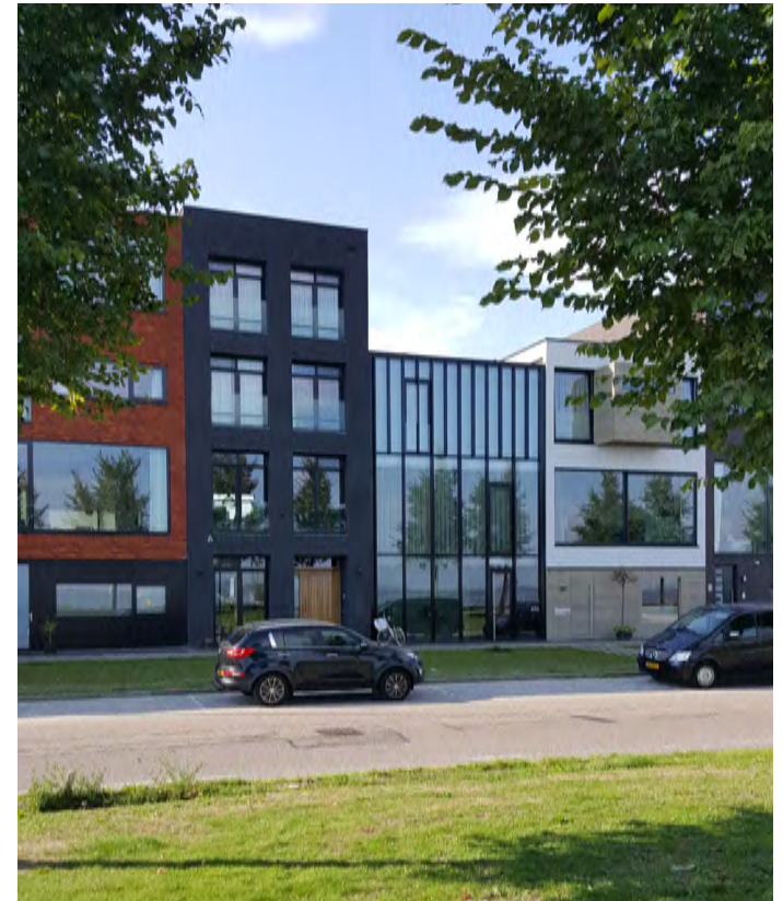
Self-build, IJburg, Netherlands