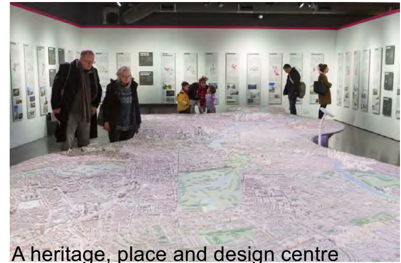
A heritage, place and design centre